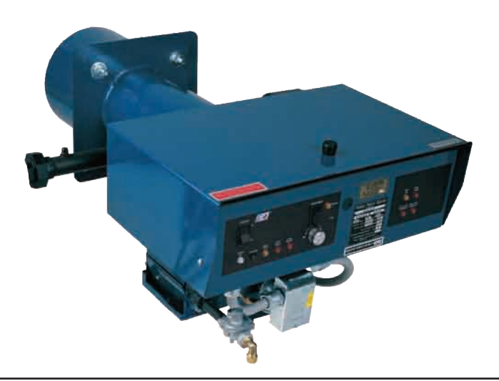
Figure 1 Model WJA